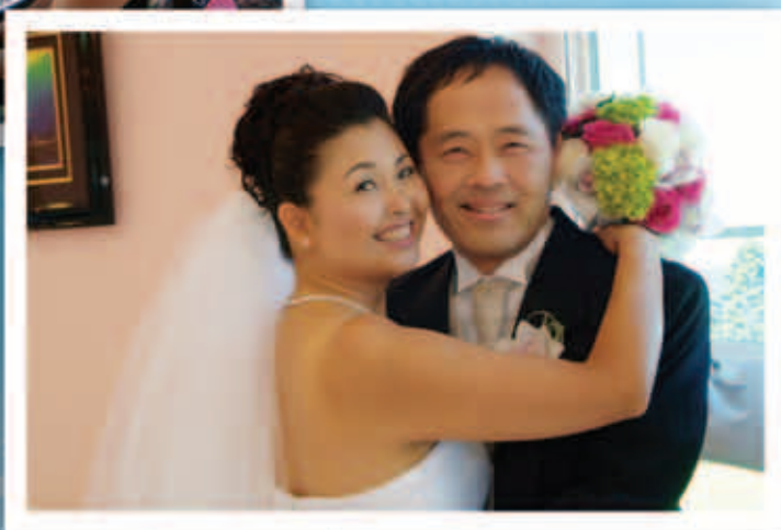
You are a Happy Couple!