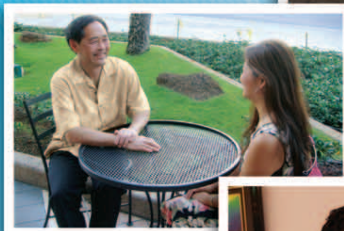
Initial Dating and Follow Up After Date