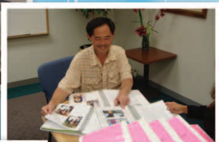
Egogram Testing/ Client Photo Albums